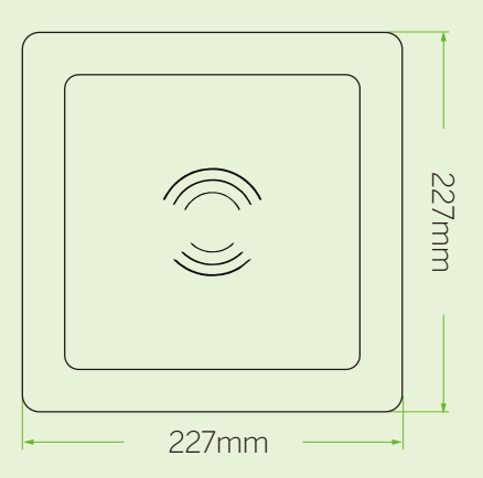
UHF-105 227 x 227 x 60mm